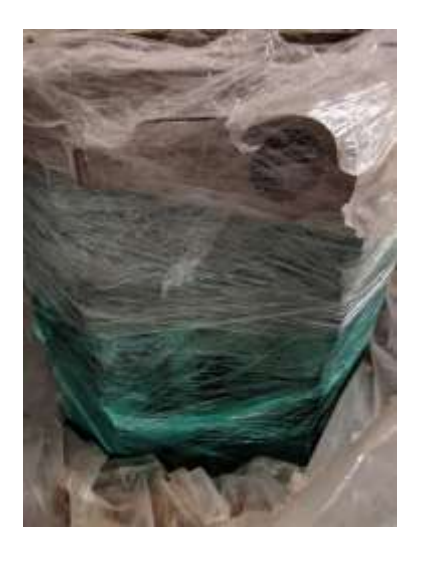
63 Poly 318 block, good block but needs bore as cylinders 1 and 3 scored - $100.00 Includes cam, lifters, timing chain and gears, pushrods, pistons, rods