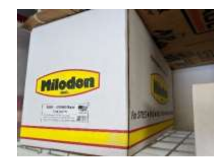
Milodon Pick Up – NEW $45.00