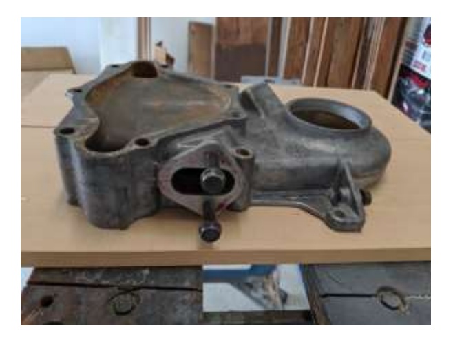
318 Timing Case – New Includes seal $60.00