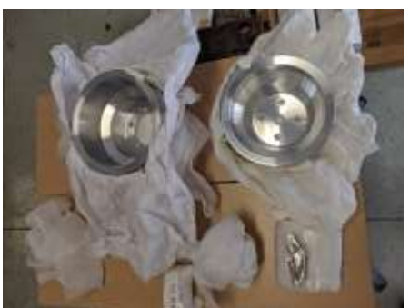
Craig Fountain Cast Aluminum Valve Covers - NEW - $300.00