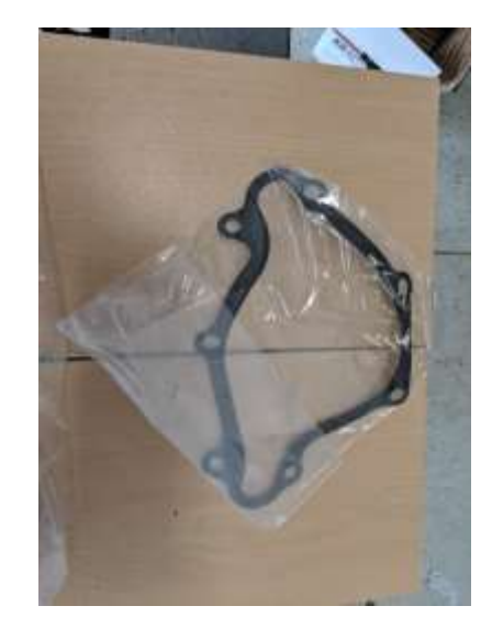
Fel Pro 318 Poly Full gasket set – NEW - $60.00